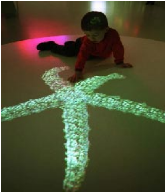
Figure 7 Mimetic Starfish