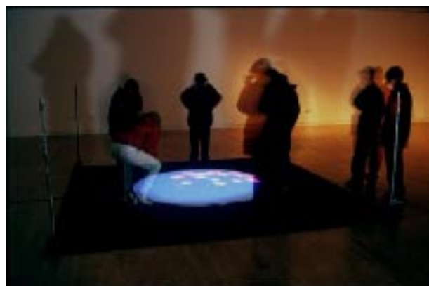
FIGURE 3 ALEMBIC, INTERACTIVE 3D INSTALLATION

In Alembic , "Virtual Reality" technology became