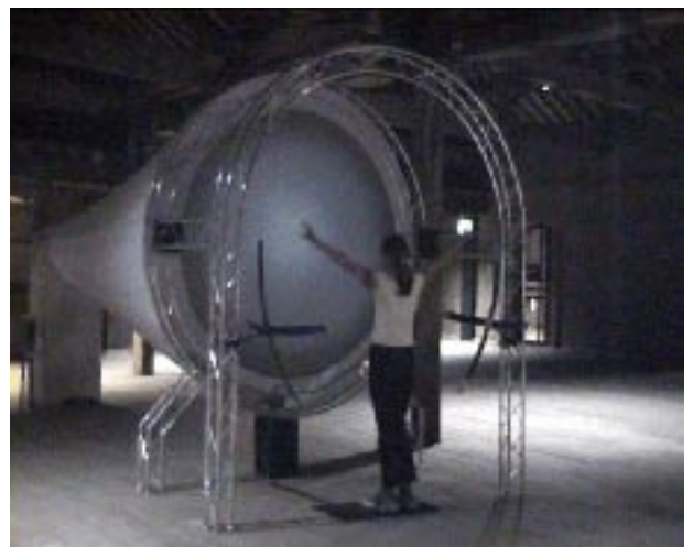
FIGURE 6 BIOTICA INSTALLATION

The starfish uses advanced principles of Dynamic Form, utilising higher space-time derivatives to create illusions of awareness and complex behaviour that resonates with real life.