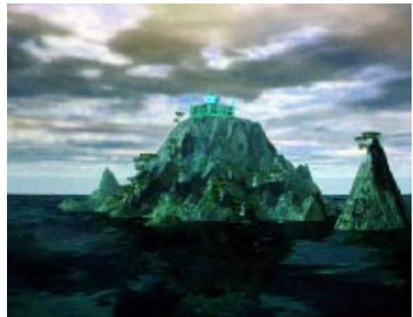
FIGURE 8 MIMESIA GAMES ENGINE IMAGE

My computer-based installations seek to create a sense of wonder, of magic. Ideally the works are transforming experiences that slide under our analytical radar, causing a deep sub-conscious resonance. My interest in mimetics parallels this quest, that through the use of mimicry, resonant illusions might be created that cause an instant non-analytical emotive response – be it of beauty or