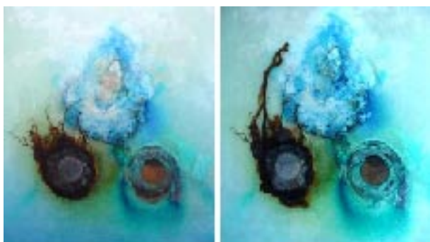
FIGURE 2 ELECTROCHEMICAL GLASS

When contemplating the infinite, we ground ourselves, meditate on the irrational complexity and holism of "The All", finding that rationality has no place and is unbound. Journeys into the psyche are fraught with danger, represented as demons, anima, the shadow, Hades, the underworld. Jung was familiar with these perils and discusses the dangers and powers of individuation and the fear of the loss of ego [15].