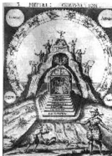
FIGURE 1 'CONJUNCTION' 1616

I believe alchemy is somewhat misunderstood due to the popular belief that it was simply about a quest to find a